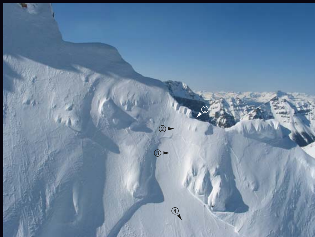
Mount Deltaform. Descent on south side of Super Couloir route ① top of route ② descent track ③ avalanche trigger location ④ fall